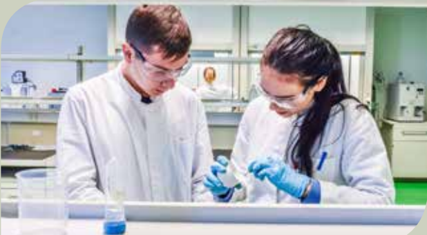
A research-focused program