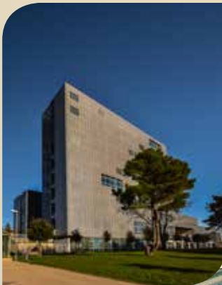
A modern high-tech department