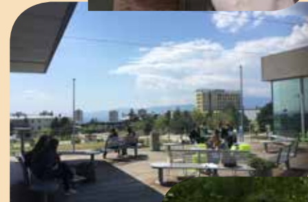
A vibrant student community