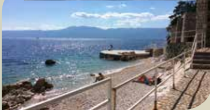
A beautiful, affordable city